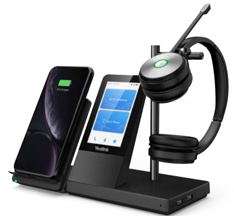
WH66 with charger * Wireless charger is optional

Busylight is enabled in WH66. With the light on the headset or BLT60 on the desk turning red, people around you would know that you are on the phone, instead of interrupting you unknowingly. Just stay focused on conversation, for higher efficiency, for better collaboration.