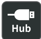
Built-in USB Hub