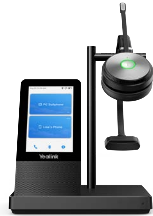
WH66 Mono/Dual: Teams WH66 Mono/Dual: UC