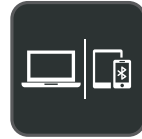
Multiple Devices Connection