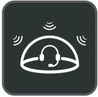
Acoustic Shield Technology

The Yealink WH66 is the Industry-leading DECT wireless headset, with WH66 Dual and WH66 Mono two models, opening an entirely new form of desktop collaboration. Work seamlessly with major UC platforms and integrate natively with Yealink IP Phones. 4.0 inch (480 x 800) capacitive touch screen of base offers newly work experience, just one touch, all control. Act as a workstation, managing phone calls, connecting with multiple devices (desk phone/mobile phone/computer), charging mobile phone wirelessly, and even playing a speakerphone's role. Best of all, deploying such a multifunctional workstation only needs to plug directly. Easiest things to do, greatest convenience to enjoy.