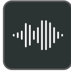
Optima Audio Experience