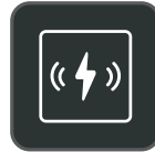
Qi Wireless Charger