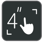
Touch Screen LCD